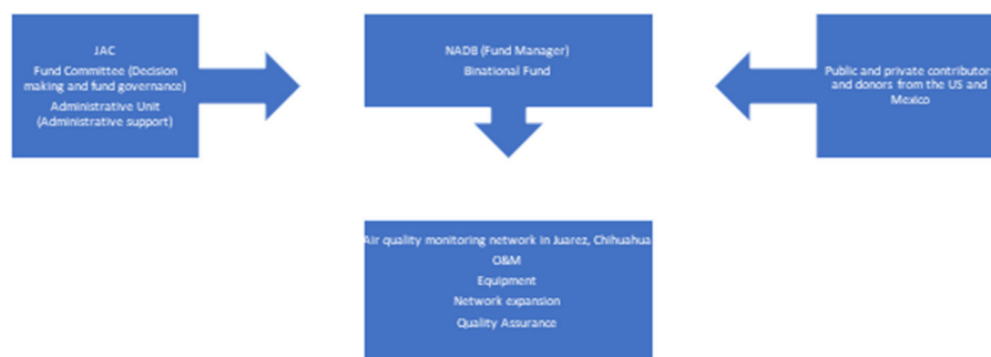
Figure 1. Structure of AQF.

During the 78 th meeting of the JAC on February 11, 2021 , members unanimously approved the Resolution for the creation of the technical commissions to support the Administrative Fund for Air Quality Monitoring in the Paso del Norte Air Basin based on the North American Development , which creates two technical commissions (Fund Committee and Administrative Unit) to govern and provide administrative support to AQF, outlining their membership and responsibilities.