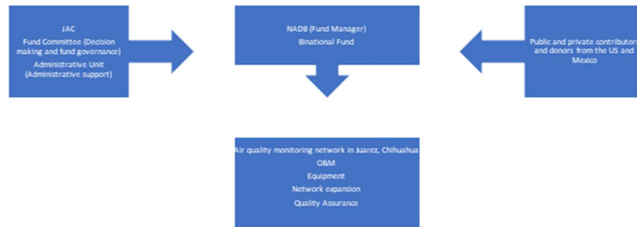
Figure 1. Structure of AQF.

During the 78 th meeting of the JAC on February 11, 2021 , members unanimously approved the Resolution for the creation of the technical commissions to support the Administrative Fund for Air Quality Monitoring in the Paso del Norte Air Basin based on the North American Development , which creates two technical commissions (Fund Committee and Administrative Unit) to govern and provide administrative support to AQF, outlining their membership and responsibilities.